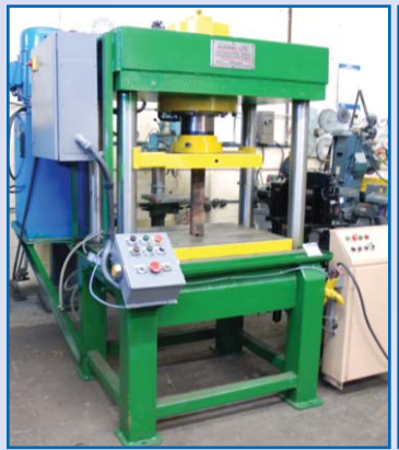
ALKANO LTD MODEL 4P 200-2005, 250 TON