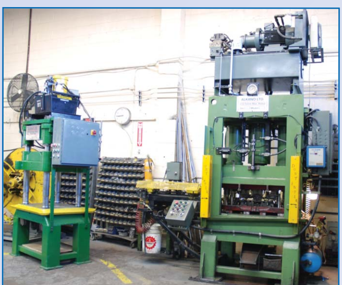
VIEW OF ALKANO LTD 250 TON AND 100 TON PRESSES