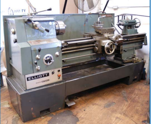
ELLIOTT ENGINE LATHE 16" X 60"