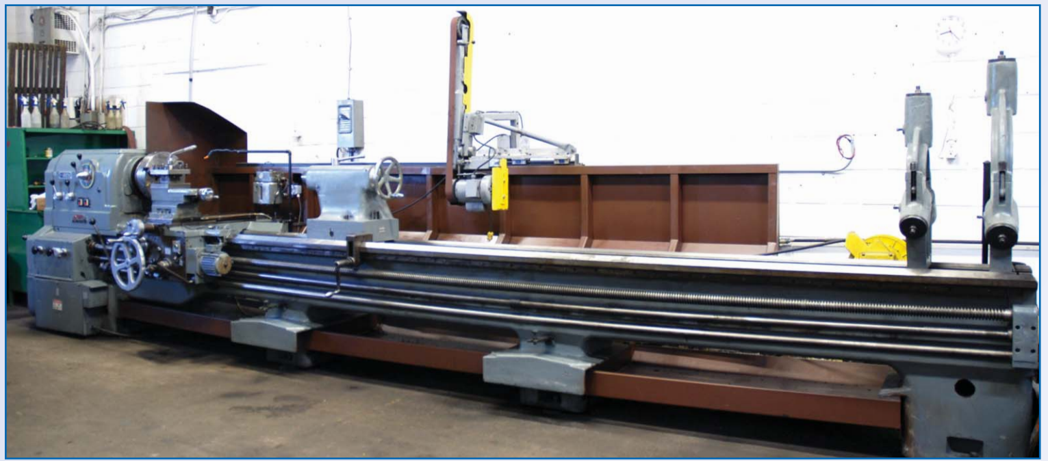
SOFIA C13/MB ENGINE LATHE 30" SWING, 20 FT. CENTER