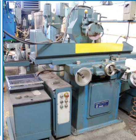
JONES AND SHIPMAN MODEL 1400, SURFACE GRINDER