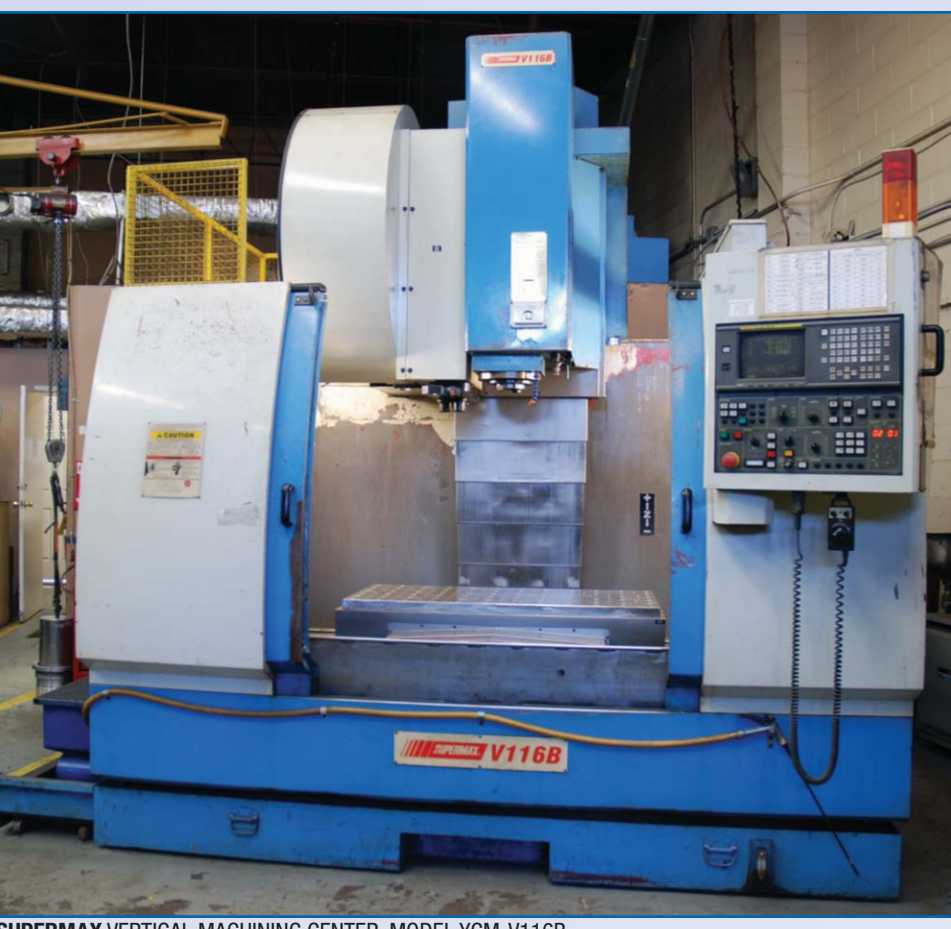
SUPERMAX VERTICAL MACHINING CENTER. MODEL YCM-V116B