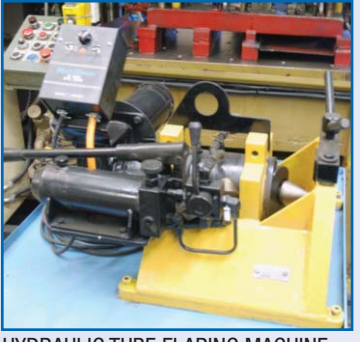
HYDRAULIC TUBE FLARING MACHINE. 0.5" TO 3" CAPACITY

CLARK 15000 Lb Propane Lift Truck. 120" lift,