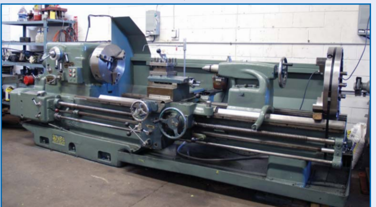
DEAN SMITH & GRACE 30" X 84" LATHE