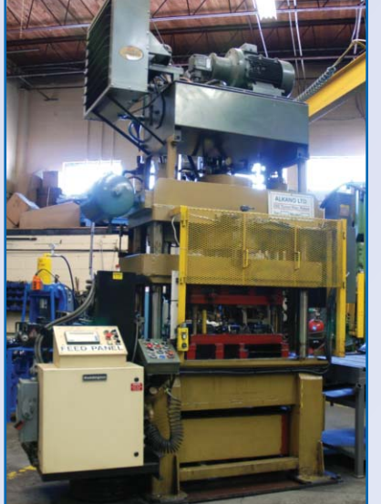
ALKANO LTD 250 TON HYDRAULIC PRESS