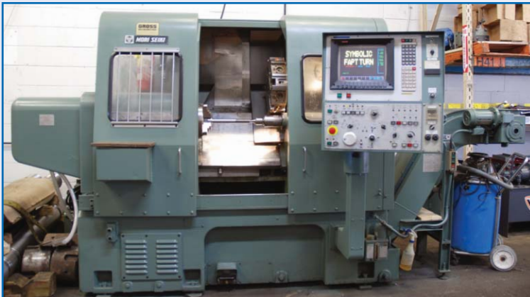
MORI SEIKI CNC LATHE MODEL SL-3