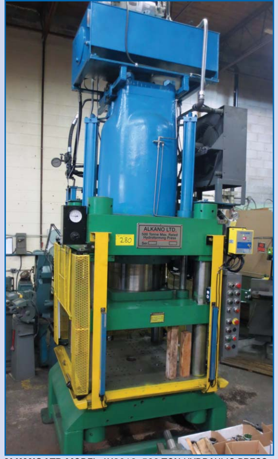
ALKANO LTD MODEL 4H2013, 500 TON HYDRAULIC PRESS