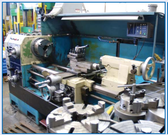
CHIEN YEH MODEL 500G, ENGINE LATHE